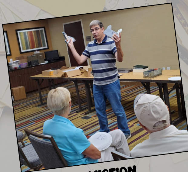
AUCTION AND MORE!