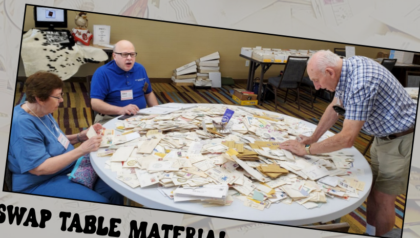
SWAP TABLE MATERIAL