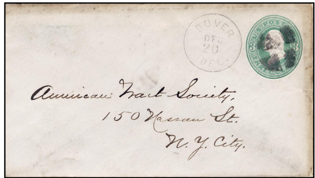
Covers from PMCC's Willett/Thompson Collection